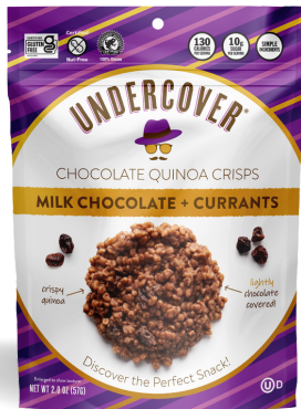
Milk Chocolate + Currants