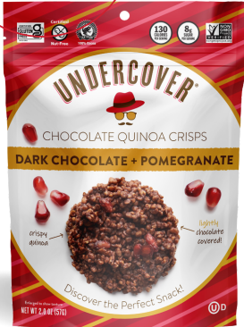
Dark Chocolate + Pomegranate