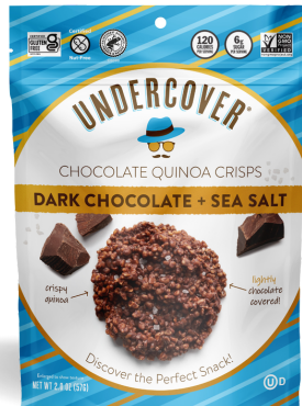
Dark Chocolate + Sea Salt