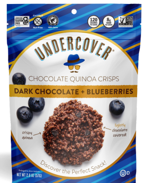
Dark Chocolate + Blueberries